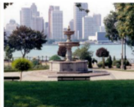
Fontana in Piazza Udine