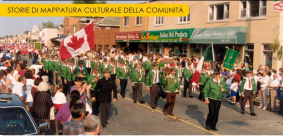
Gli Alpini in processione per la sagra di Sant'Angela Merici, anni '90

STORIE DI MAPPATURA CULTURALE DELLA COMUNITÀ