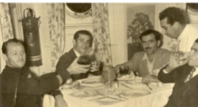
A bordo della SS Argentina, 1951

Verso il crepuscolo della domenica si celebra la Santa Messa all'aperto sulla scalinata dell'entrata principale, seguita da una processione a cui partecipano varie associazioni e società religiose insieme ai fedeli di Windsor e dintorni, che recitano il rosario e cantano inni. Il festival si conclude con fuochi d'artificio e un sorteggio. Si spera che le tradizioni italiane continuino ad essere osservate e perpetuate nella nostra comunità perché esse rappresentano il nostro retaggio spirituale, culturale e sociale.