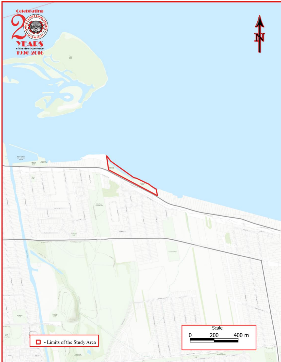
MAP 1 LOCATION OF THE STUDY AREA (ESRI 2019)