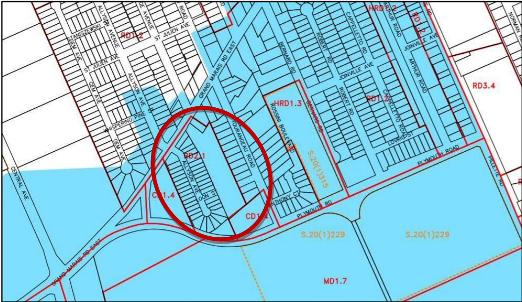
Figure 5 – ZBL

The Site is currently zoned "Residential District 2.1 (RD2.1)" on Map 11 of the City of Windsor Zoning By-Law 8600 (see Figure 5 – ZBL).