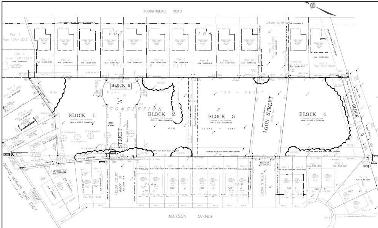
Figure 2b – Draft Plan

The draft plan illustrates the blocks to be created for the lots and the roadways.