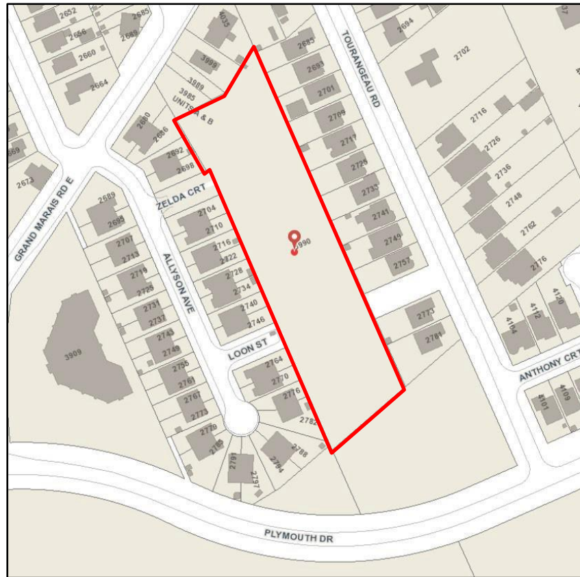
Figure 1 – City of Windsor, Map My City

The Site is made up of one (1) parcel of land located in Ward 5 on the east side of Loon Street, south of Grand Marais Rd E and north of Plymouth Dr (see the area in red on Figure 1).