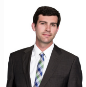
Mayor Iveson EDMONTON